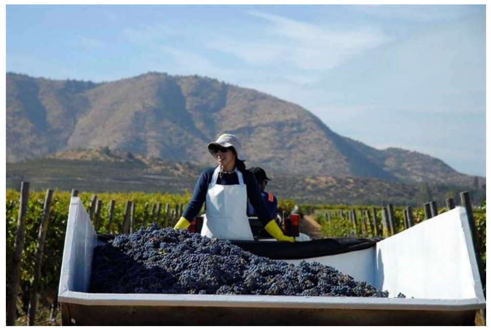
Alcohol: 13,5 %